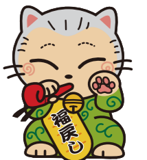
The character of "FUKIMODOSHI NO SATO" "FUKUNeko" Fortune (Blowing) cat