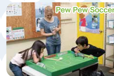
Pew Pew Soccer